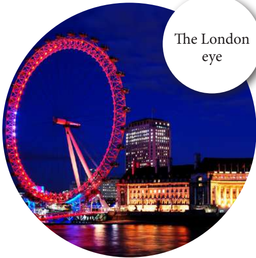
The London eye